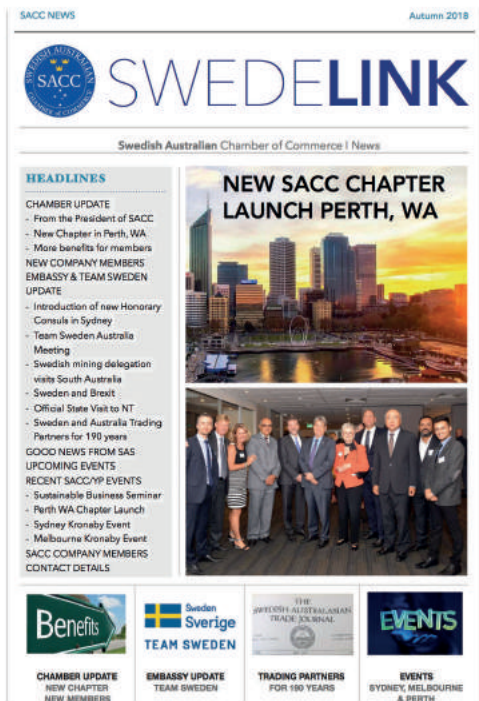
Front cover of the Swedelink Autumn issue 2018.