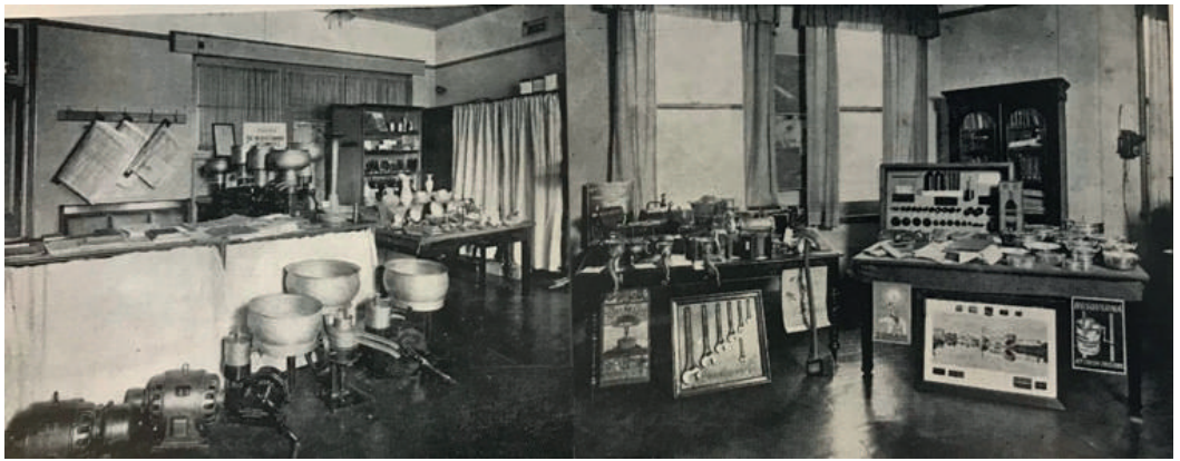
Swedish sample room established by the Chamber at 16 Carrington Street, Sydney. The picture is from 1922.

The Australian Government decided to establish a legation in Sweden in 1961, thereby completing the exchange of missions. The Australian Trade Commission in Sweden, established in 1958, was integrated in the new legation at Hötorget, Stockholm. Mr Carney, the Australian Trade Commissioner was appointed as Chargé d’Affaires Ad Interim.