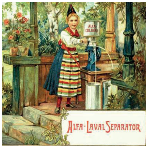
The Separator - Swedish iconic export success.